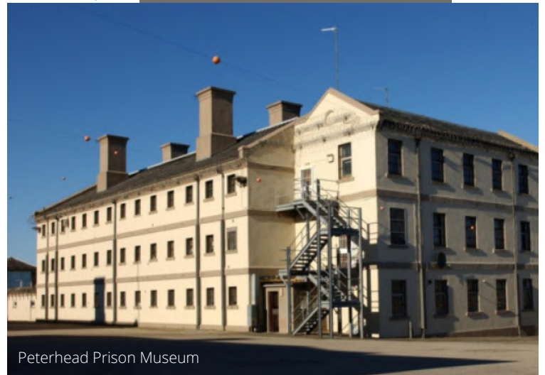
Peterhead Prison Museum

Today we travel north on the Aberdeen bypass and to one of the region's more unusual attractions – a former prison. The award-winning Peterhead Prison Museum gives an insight into life behind bars in what was known as Scotland's toughest jail. During an audio tour you'll not only learn about key events in its 120-year-plus history – including the time the SAS were sent in to end a siege – but hear personal stories from former guards.