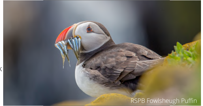
RSPB Fowlsheugh Puffin

Make the recently renovated Aberdeen Art Gallery your first port of call. The venue has sculptures, photographs and some fantastic pieces from Scottish artists as well as those of international acclaim. There are also visiting exhibitions from time to time, not to mention collections of decorative arts, textiles and crafts. If you have time, be sure to visit the roof terrace where you'll experience great views of the city.